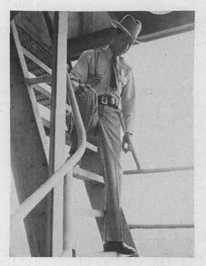
A STEEP STAIRWAY and here is shown the way to go down it—the WRONG way. Face the steps and hang on to the handrail and look where you are going. Caution always pays.